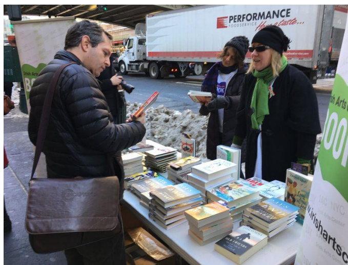
A passerby stops to browse a table of free books being given away by the Irish Arts Center for St. Patrick's Day.

"They make us think about the importance of building bridges across communities, and across people from different backgrounds," he said.